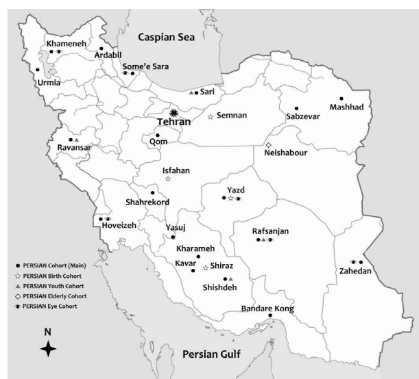
Figure 2. PERSIAN Cohort Sites Throughout Iran. The Cohort sites have been chosen to include all the major ethnicities and geographical areas within Iran to capture different exposures.